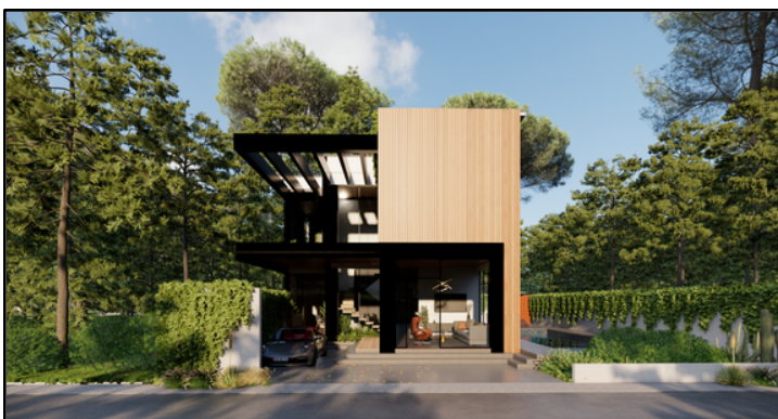
Villa Salem - The winning design