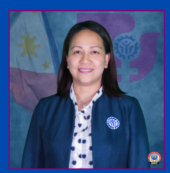
Chief Administrator TESDA Women's Center