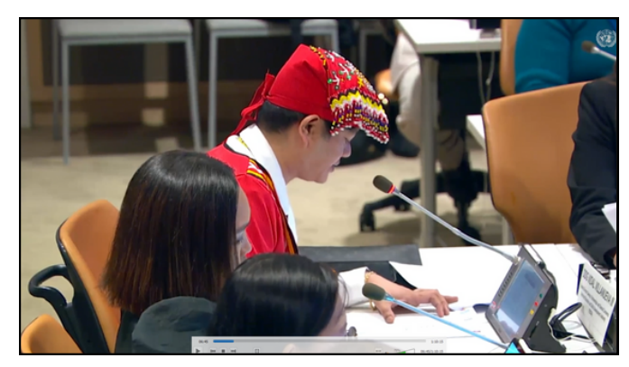
DDG for Partnerships and Special Concerns Vidal D. Villanueva talks about making women's empowerment in TVET digital during the UNCSW68 side event in New York City, USA

The DDG for Partnerships and Special Concerns Vidal Villanueva III expressed the need to address the low access and unavailability of ICT tools especially for women and girls. In TVET, it is imperative to bridge the digital divide and unlock the digital empowerment of women to build their full capacities and foster sustainable development.