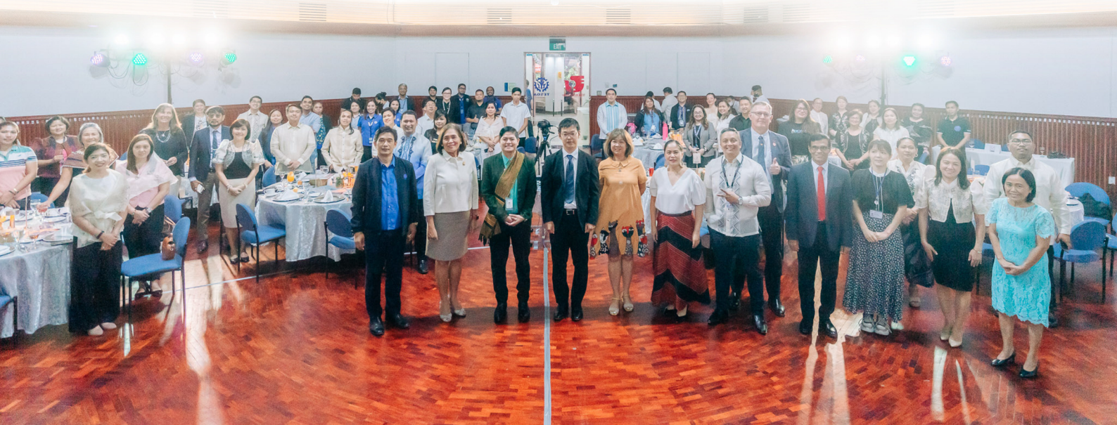
A group photo of TESDA Officials, and representatives of Partners and Stakeholders of TWC during Appreciation Ceremony of TWC Partners and Stakeholders

Forty (40) external partners from various sectors, international organizations, national government agencies, sponsoring companies, academe, and members of the Center Advisory Council (CAC) and twenty-two (22) within TESDA were awarded Certificates of Appreciation and Tokens.