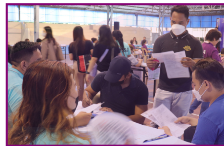
Job seekers applying for job during the Job Fair 2023

As part of TESDA Women's Center (TWC) 25th Founding Anniversary Activities, the TWC in collaboration with the other TTIs such as Human Resource Development Center (HRDC), National Language Skills Center (NLSC), National Capital Region – Regional Training Center (NCR-RTC), Pasay Makati District Training and Assessment Center (PMDTAC), Muntlupa District Training and Assessment Center (MDTAC) and the Public Employment Service Office (PESO) Taguig City, conducted the 2023 Job Fair at TESDA Covered Court held on April 13, 2023.