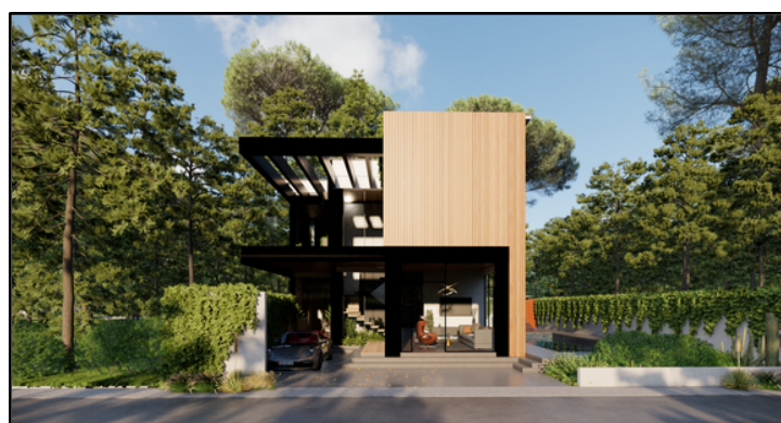
Villa Salem - The winning design

The design was judged based on the following criteria: (1) Interior layout with good circulation, lighting, air conditioning, and room dimensions, (2) Promoting local wisdom while maintaining a modern aesthetic, (3) Incorporating green building principles, and (4) Demonstrating uniqueness Incorporating Dekkson products.