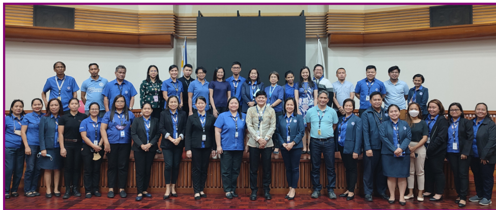
TWC Family with DDG Vidal D. Villanueva, III during the 1st General Assembly of TWC

The TESDA Women's Center (TWC) family held its First General Assembly with the Deputy Director General for Special Concerns, DDG Vidal D. Villanueva III, on January 30, 2023, at the Tandang Sora Hall, TESDA Women's Center.