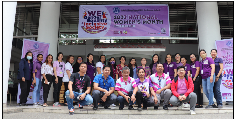
TWC Personnel showed their support in the celebration of International Women's Day

These initiatives promote our advocacy to embrace equity in order to achieve social inclusion and gender equality in TVET.