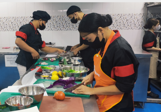
Trainees of Cookery NC II during their practical exercise in preparing and cooking dishes.

The trainees were tasked to perform standard procedure of preparing and cooking stocks, sauces, soups and appetizers, salads and dressings, hot and cold sandwiches, and meat dishes.