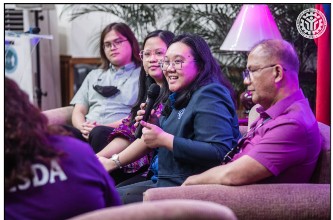
(Right) Invited panelist and resource persons in a panel discussion during the “Agenda ni Juana sa TVET” Forum.

On March 28, 2023, the TESDA Gender and Development Focal Point System (GFPS) and TESDA Women's Center spearheaded the “ Agenda ni Juana sa TVET ” Forum with the theme “Women and Everyone (WE) for Gender Equality and Inclusive Society” held at the TWC Tandang Sora Hall in Taguig City and live via TESDA Facebook Page.