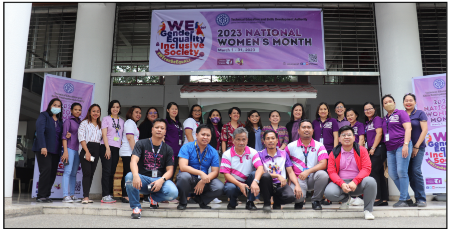
TWC Personnel showed their support in the celebration of International Women's Day

The TWC also spearheads the conduct of “SERBISYO PARA KAY JUANA” to showcase the skills of graduates and trainers and provide Juanas (all female employees, female trainees, and walk-in training applicants) with complimentary treats from Barista, Bartending, and Cookery TVET programs.