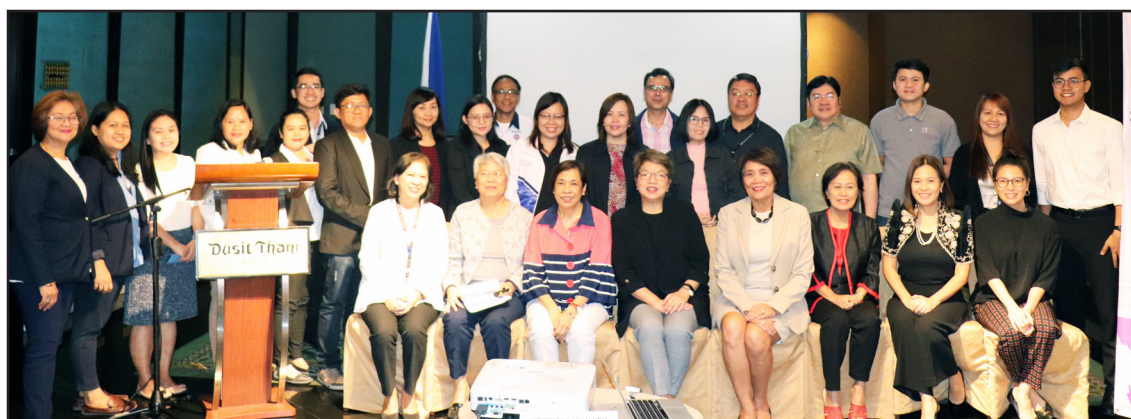
Participants of the Stakeholder's Forum composed of the members of the Center Advisory Council of TESDA Women's Center, TWC trainers and staff together with representatives from the Construction Sector.

On December 3, 2019, the TESDA Women's Center (TWC) through the guidance and recommendations of the Center Advisory Council (CAC) organized a successful Stakeholders' Forum in the Construction Sector at Dusit Thani Manila, Makati City.