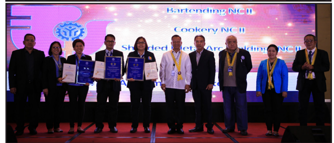
(top) Awarding of 1 Star Level Ratings of 6 Training Programs of TESDA Women's Center.