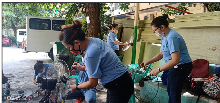
Trainees of Electronic Products Assembly and Servicing NC II provided extension services at the Upper Bicutan Elementary School, Taguig City during the DepEd's Brigada Eskwela '19

The Department of Education (DepEd) recently conducted the 2019 Brigada Eskwela last May 20-25, 2019, or the National Schools Maintenance Week which is a five (5) day activity that aims to unite all education stakeholders to participate and put in their time, effort, skills, and resources to prepare and maintain the cleanliness and orderliness of public schools in preparation for the upcoming opening of the school year in June. The theme for this activity is "Matatag na Bayan para sa Maunlad na Paaralan."