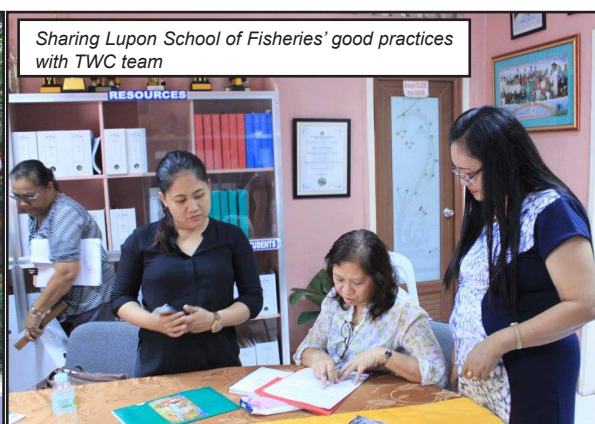
Sharing Lupon School of Fisheries' good practices with TWC team