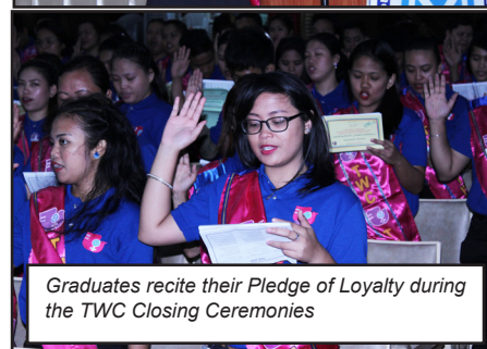
Graduates recite their Pledge of Loyalty during the TWC Closing Ceremonies

“I was a marine student at the PMI Manila, aspiring to be a seafarer like my brother.” She continued, “One day my brother who worked as a seafarer arrived from Europe, and he told me the good things about welding because he worked there as a welder. It was the turning moment when I started to dream again and my training journey at the TWC started.”