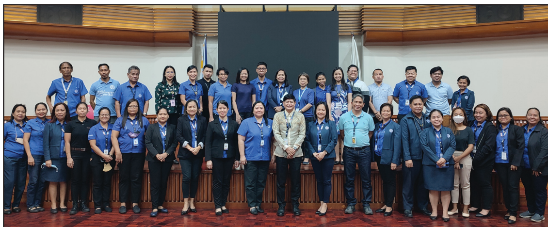
TWC Family with DDG Vidal D. Villanueva, III during the 1st General Assembly of TWC.

The TESDA Women's Center (TWC) family held its First General Assembly with the Deputy Director General for Special Concerns, DDG Vidal D. Villanueva III, today, January 30, 2023, at the Tandang Sora Hall, TWC.