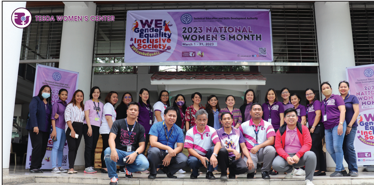
TWC Personnel showed their support in the celebration of International Women's Day

On March 8, 2023, the TESDA Women's Center in coordination with the TESDA GAD Focal System joins the Annual International Women's Day by supporting the #PurpleWednesday Initiative by wearing purple to signify support for women's empowerment and gender equality especially this March.